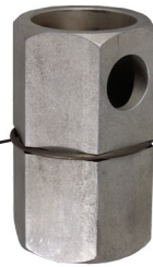
MEP200FIR/MEP300FIR Hex Installation Tool

Travel stop prevents damage to relief valve seat