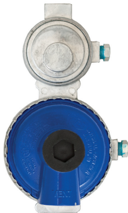
MEGR-291L REGULATOR WITH DRIP LIP VENT