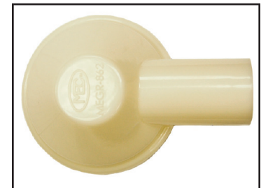
MEGR-862 Automatic Changeover Regulator Cover for MEGR-253 & MEGR- 291 Series