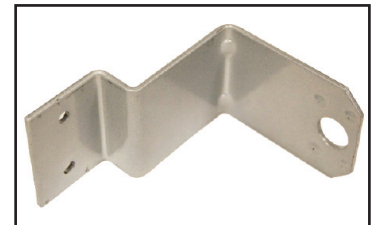
MEGR-RVB L-Mounting Bracket