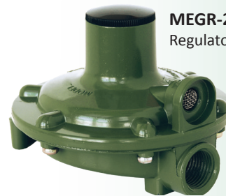
MEGR-230 Regulator with Drip Lip Vent