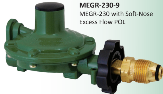
MEGR-230-9 MEGR-230 with Soft-Nose Excess Flow POL