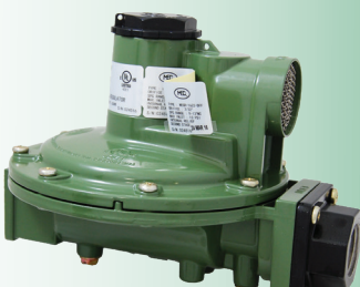
MEGR-1622-DFG Full Size Inline 12-24" WC