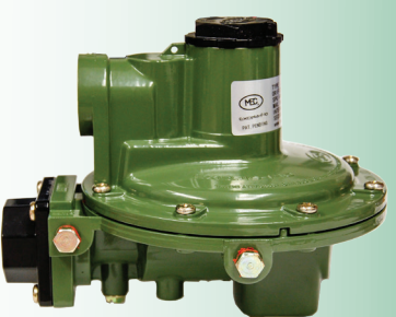
MEGR-1652-DFG Back Mount 12-24" WC