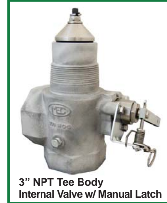
3" NPT Tee Body Internal Valve w/ Manual Latch