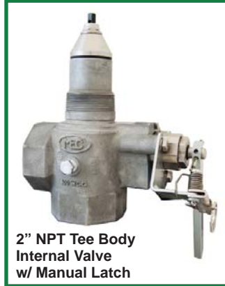
2" NPT Tee Body Internal Valve w/ Manual Latch