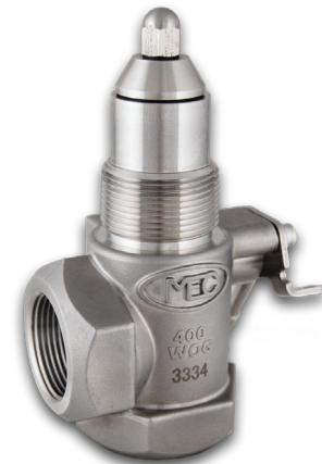
1-1/4" NPT Tee Body Internal Valve