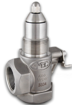
1-1/4" NPT Tee Body Internal Valve