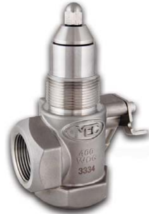
1-1/4" NPT Tee Body Internal Valve