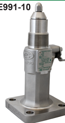
1-1/4" MNPT x 4 Bolt Flange Internal Valve