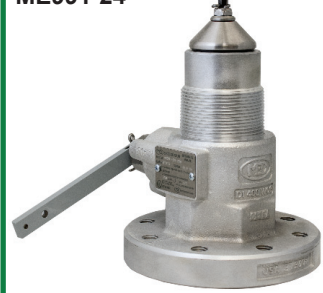
3" MNPT x 3"- 300LB Flanged Internal Valve