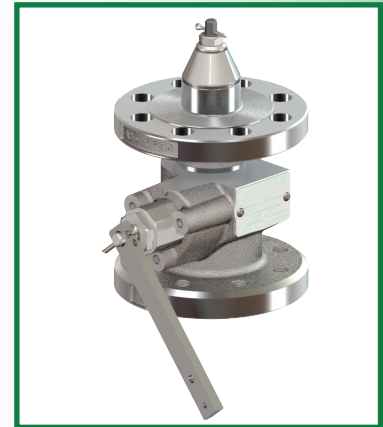
ME990S-2DFM 2"-300# Double Flange