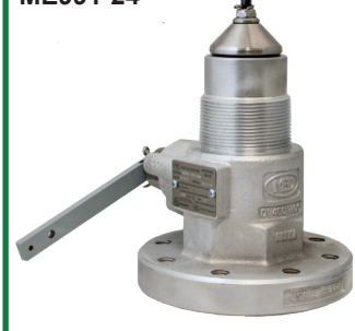
3" MNPT x 3"- 300LB Flanged Internal Valve