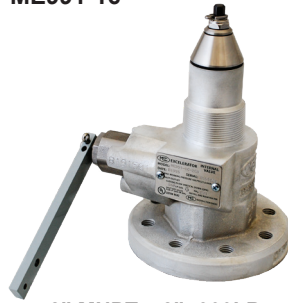
2" MNPT x 2"- 300LB Flanged Internal Valve