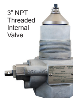
3" NPT Threaded Internal Valve