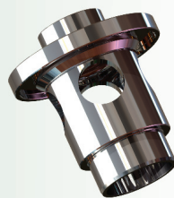
ME840C-16-104 Classic Poppet

*Designed to create higher differential pressure and increased poppet travel in low flow applications such as bobtails