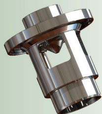
ME840-16-104 Standard Poppet

* Alternate spring ranges available. Please see replacement parts section