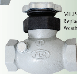
ME825-6 Vent Valve Not Included