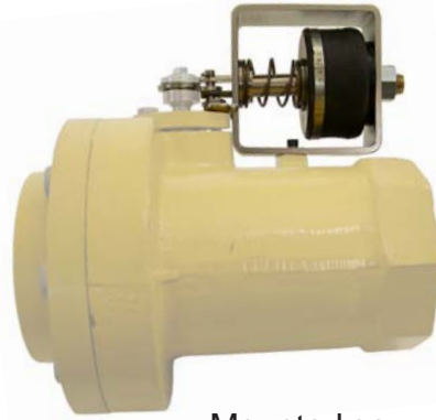
Mounted on 3" ESV