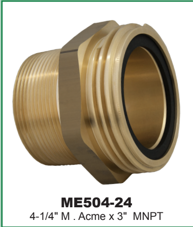
ME504-24 4-1/4" M . Acme x 3" MNPT