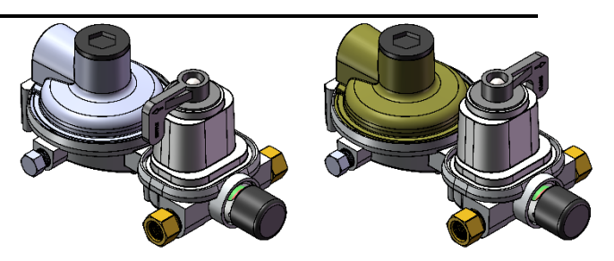
Figure 1: MEGR-253 & MEGR-253H

The "primary" side of the regulator will continue to supply gas as long as sufficient gas is present in the "primary" cylinder. When pressure in the cylinder drops below a designated pressure, the "reserve" side will open and continue to primary gas to the regulator. At the time that the "primary" cylinder becomes exhausted, the indicator on the changeover lever will turn partial red and green, indicating a cylinder change can be made.