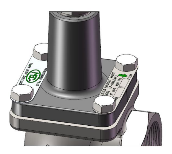
FIGURE 1 PILOT VALVES