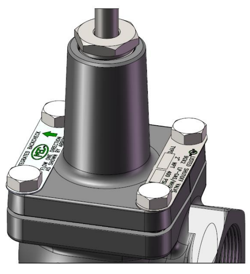
FIGURE 2 IBC VALVES