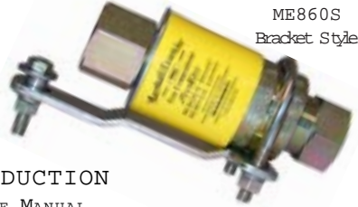
ME860S Bracket Style