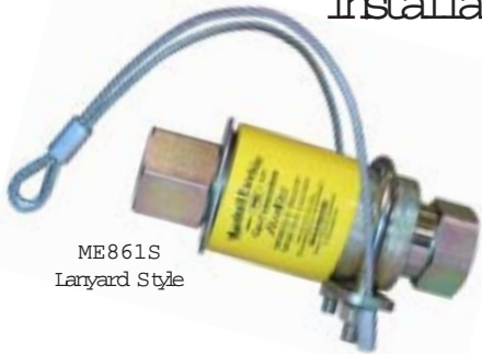
ME861S Lanyard Style