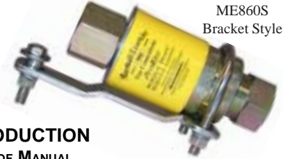
ME860S Bracket Style