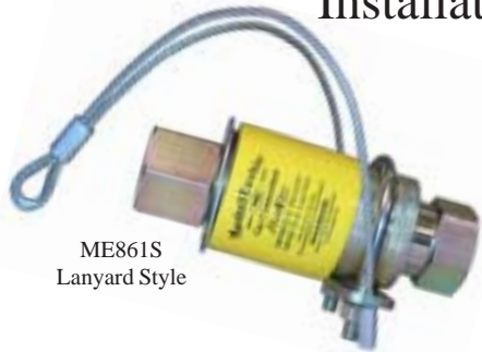
ME861S Lanyard Style