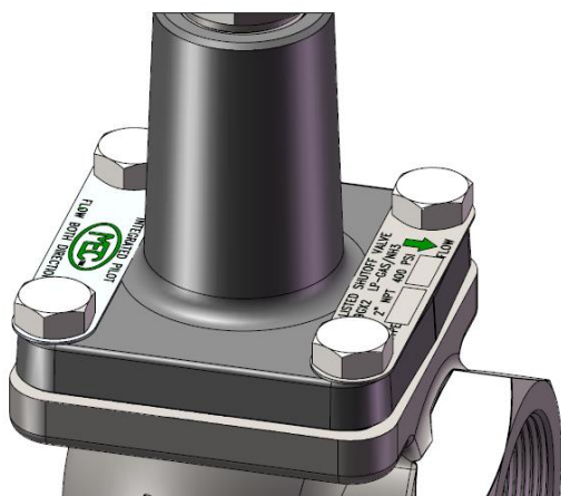
FIGURE 1 PILOT VALVES